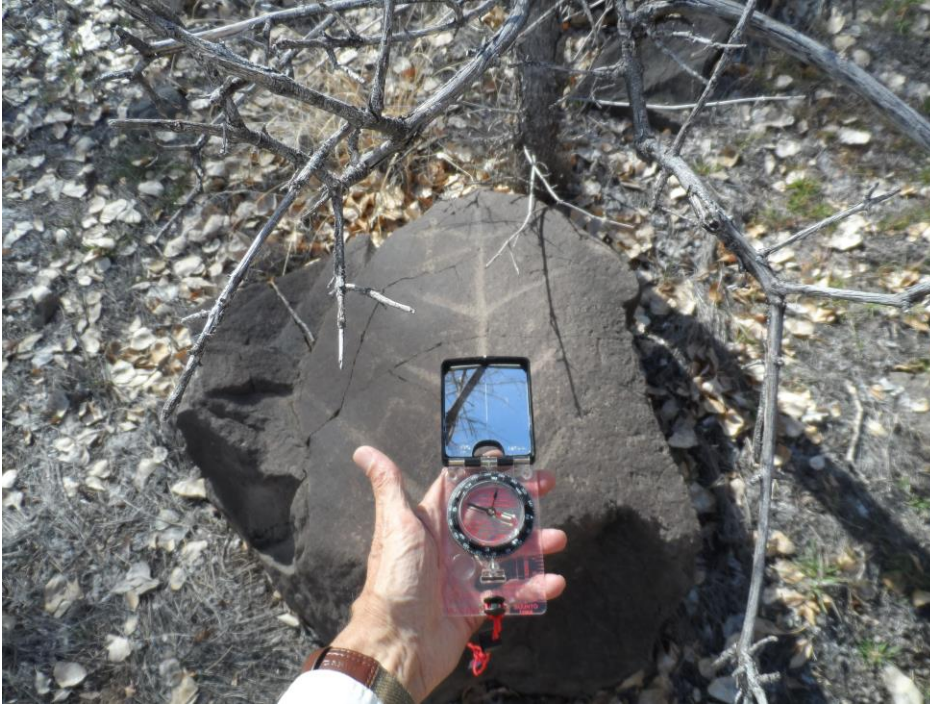
Photo below taken on the Spring Equinox