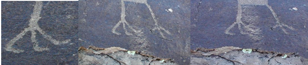
Light shaft moves left

I go into the use of a bird foot in more detail in my article http://www.manataka.org/page2673.html